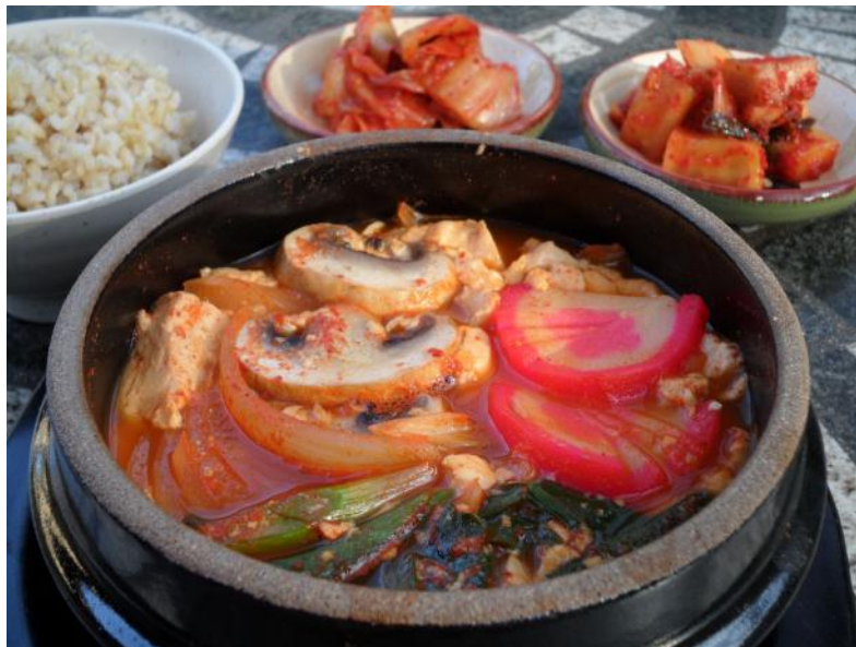
Beef Tofu Soup

Tofu simmering in a spicy broth with shiitake mushroom, veggies and rice cake. Served with rice & kimchee. Choose flavor from list at right.