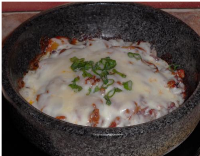
Mozzarella sizzling stone pot

Bowl of steamed white or mixed rice combined with kimchee and spicy pork, topped with melted mozzarella cheese & green onion.