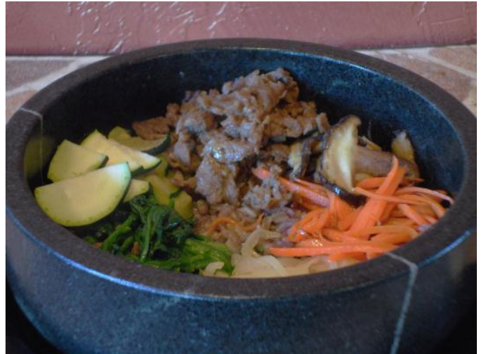
Beef sizzling stone pot