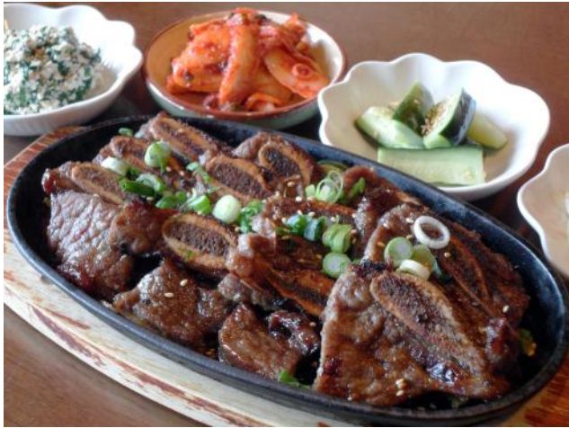
Galbi and side dishes