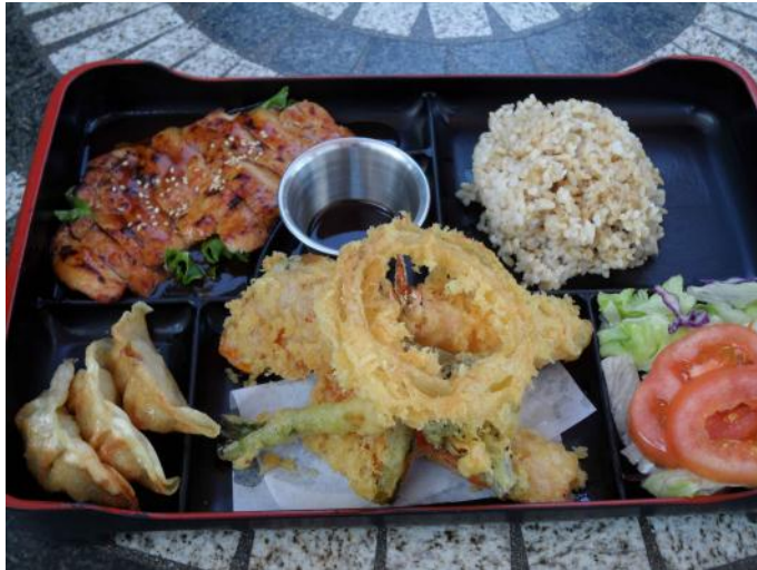
Chicken Teriyaki & Tempura Bento