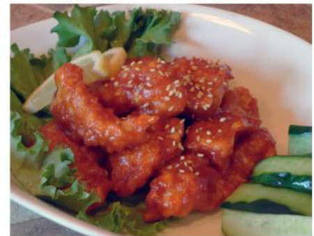
Spicy Chicken strips