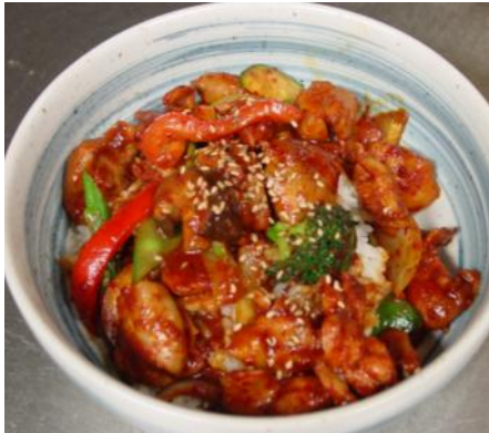
Spicy Chicken bowl

Bowl of white or mixed rice with sauté veggies and any one item.